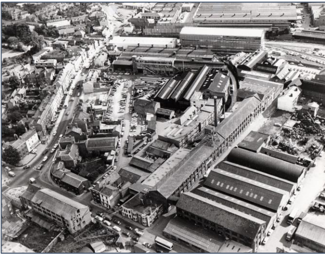
Factory layout prior to demolition

Edward VII's Coronation in 1901. An internal combustion engine drove it.