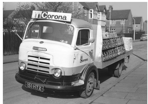
Beware super carriers