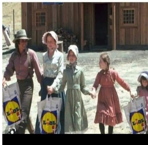
LIDL house on the Prarie