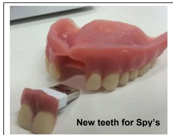
New teeth for Spy's